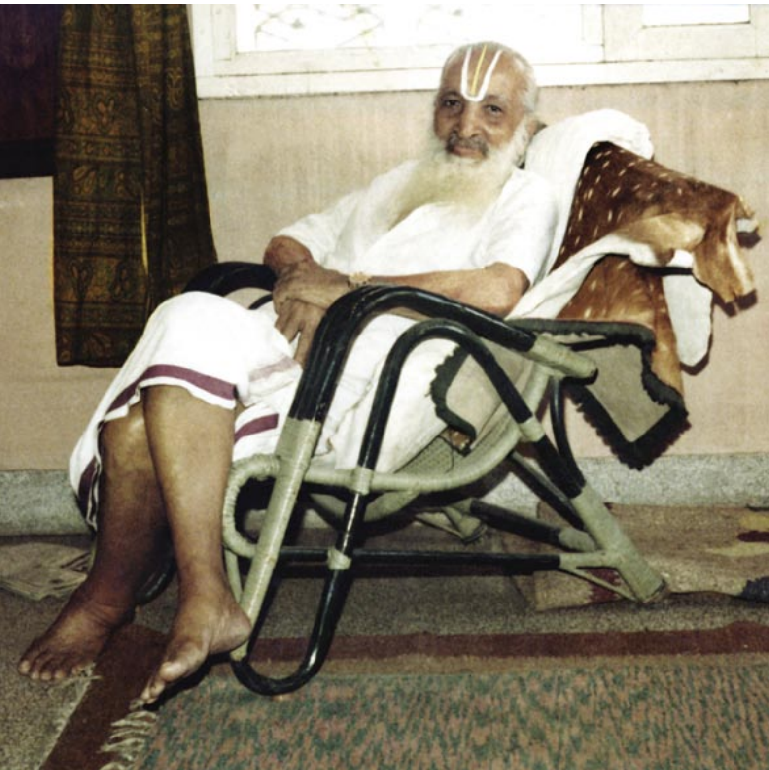
Śrī Krishnamacharya during class at his residence in R.K. Puram.