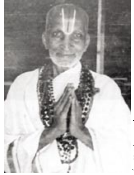
Śrī Krishnamacharya.